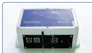
AutoNav™ Control System

AutoNav™ Control System Embedded GPS and Compass Built-in Telemetry System PC laptop Mission Planner Application USB Radio Telemetry