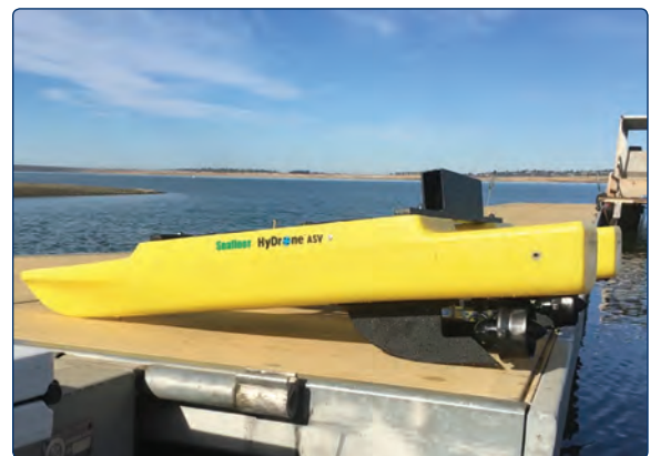
Side view of HyDrone

The mission planner application runs on a base station laptop connected through a radio telemetry link, and displays the vehicle's graphical position and progress against a background map of the survey area. Battery voltage, current, and capacity remaining is monitored via this link.