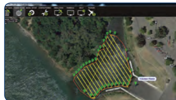
Mission Planner application installed on a PC laptop showing preplanned survey