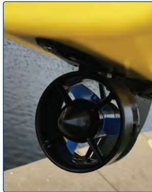
Powerful differential thrusters for maneuverability