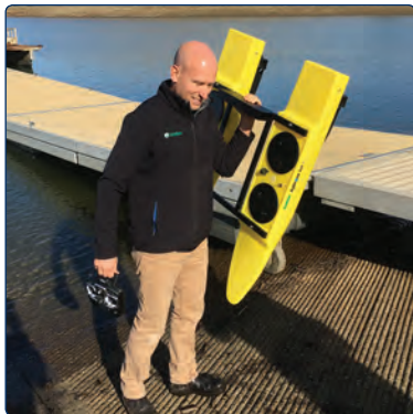
Light-weight and portable